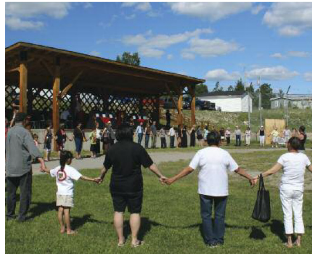
Credit: RounddanceatFriendshipAccordSigningin2014. The First Nations–Municipal Community Economic Development Initiative (CEDI)

The launch event culminated with a preview of the promotional video developed as part of the tourism strategy. With the fitting theme “At the heart of nature,” the three communities are poised to take flight into their future.