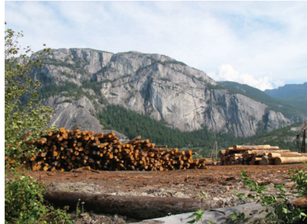
Credit: Log sort in Squamish. Union of BC Municipalities (UBCM), Pathways for Collaboration

For more information on the project, visit www.ubcm.ca