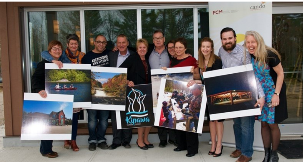
Kebaowek First Nation, Town of Témiscaming, Municipality of Kipawa and CEDI staff pose with newly created assets for promoting tourism.

The First Nations–Municipal Community Economic Development Initiative (CEDI) is a joint project of the Federation of Canadian Municipalities (FCM) and Cando (the Council for the Advancement of Native Development Officers). From 2013 to 2016, the initiative worked with six community partnerships across Canada in urban, rural and remote settings. Hundreds of communities expressed interest in collaborating with this unique initiative and as a result, FCM and Cando are currently implementing a second phase of CEDI until 2021.